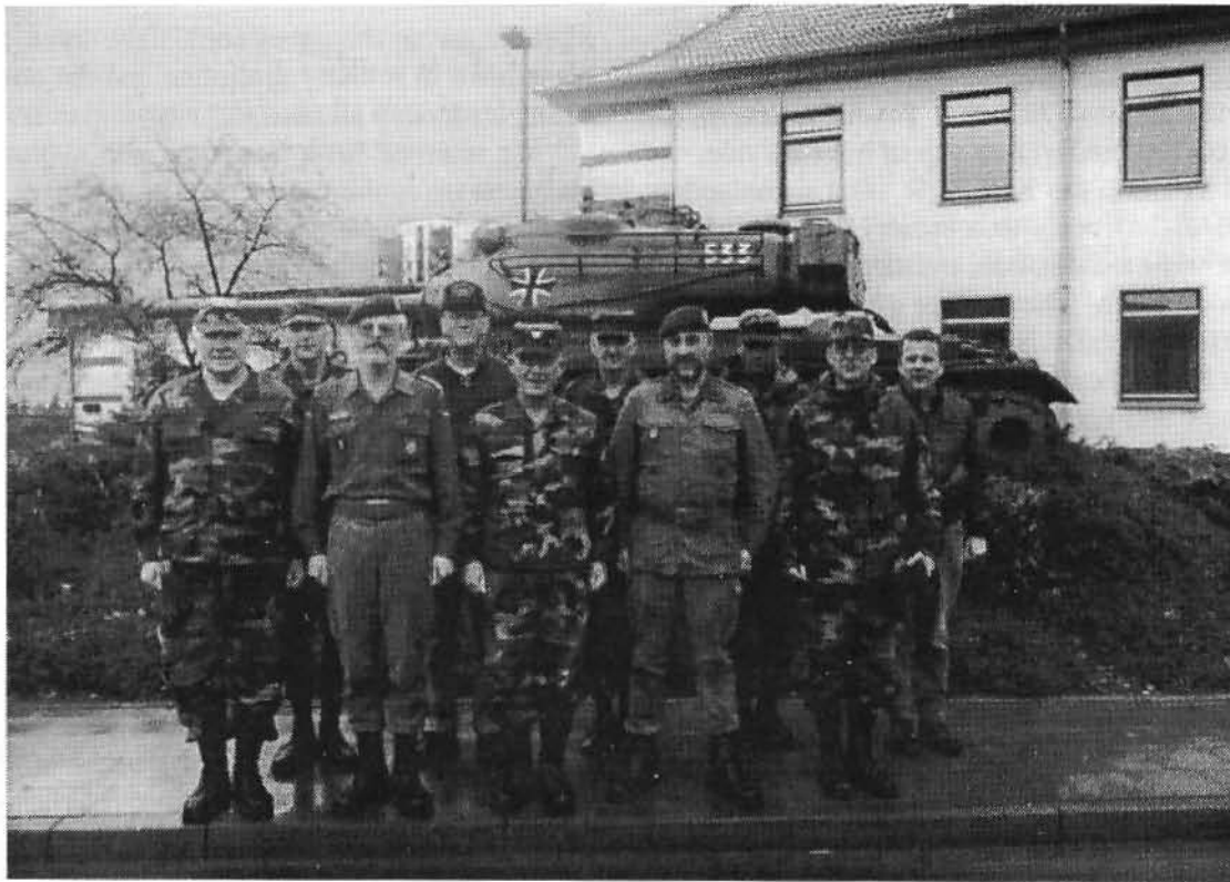
U.S. and German Battle of Schmidt staff ride participants, 5 April 1993.